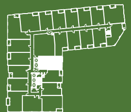
Floors 5 - 8